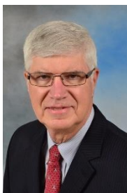
Center Specialist, CTE Technical Assistance Center of NY