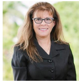
Dean, College of Education, Lynn University